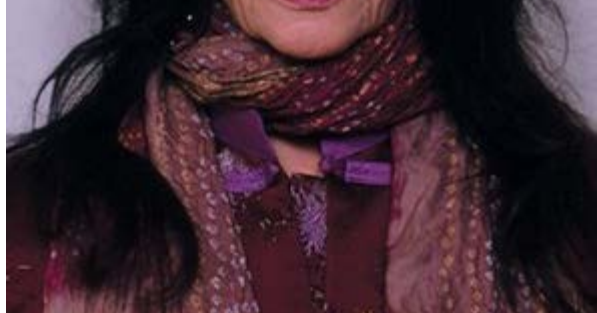
Anne Waldman.

The events include a poetry reading, a Creativity Conversation, and the exhibition's opening reception.