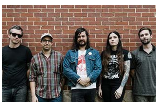
The band Uniform will play at Create Your Own Culture: A Rose Library DIY Celebration on Thursday, March 1.

In honor of its burgeoning collections documenting the history of Atlanta's punk scene, the Rose Library is hosting a night of music, poetry and art to celebrate Atlanta's "do-it-yourself" culture on Thursday, March 1, at 6:30 p.m. in Emory's Visual Arts building, 700 Peavine Creek Dr. on campus.