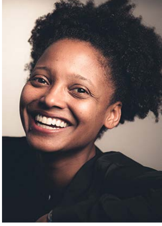
Tracy K. Smith.

Don't miss the chance to hear U.S. Poet Laureate Tracy K. Smith read her work at the Schwartz Center for the Performing Arts on Saturday, Feb. 17, at 4 p.m. The reading is open to the public at no charge, and no tickets are needed.