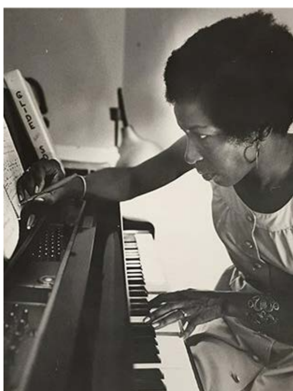
Mari Evans at the piano.

"The Rebel: In Celebration of Mari Evans" will recognize Evans' impact on the Black Arts Movement. The event, which will be held on Wednesday, Feb. 21, at 6:30 p.m. in the Woodruff Library's Jones Room, will begin with a reception. A reading of Evans' poems by students will be followed by a panel of scholars, who will discuss Evans' contributions as a writer, educator, musician, activist and poet.