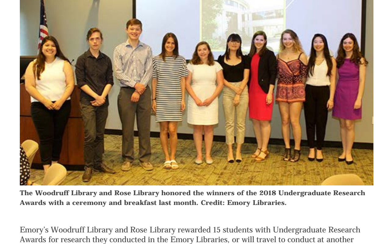
Four awards were given: for students in any discipline using Woodruff collections and resources; for students in an English class using Rose Library resources, and for those in a non-English class; and

Libraries reward undergraduate students for outstanding research