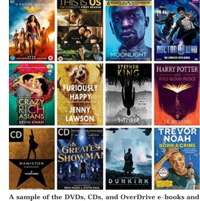
audiobooks available to Emory and Oxford staff (and faculty and students), courtesy of Emory's Music & Media Library.

The perfect summer reading, listening, and movie-watching options are available to Emory staff—at no cost—at the Music <u>& Media Library</u>, on the fourth floor above the lobby in the Woodruff Library.