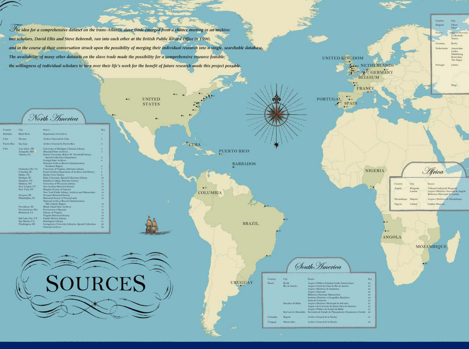
Above, detail of a map illustrating information found within the Trans-Atlantic Slave Trade Database, P. 10

Philanthropic support enables Emory Libraries to serve a vital role in the academic and cultural life of the campus.