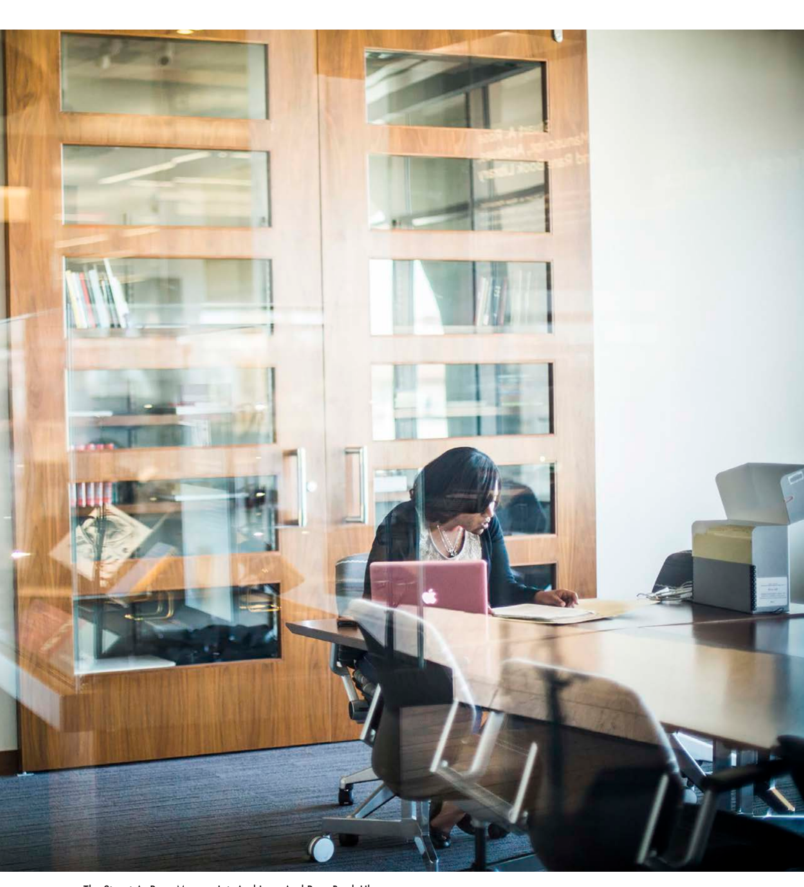
The Stuart A. Rose Manuscript, Archives, And Rare Book Library